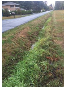
Figure 12: The U.S.-Canada Border Demarcation in Blaine, Washington

Image taken during bipartisan STAFFDEL to the Blaine, Washington Sector (Aug. 2015)