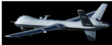
Figure 9: Predator B Land Mission UAS

OAM also utilizes the Predator B UAS for detection capabilities, particularly with the advent of attaching a Vehicle and Dismount Exploitation Radar (VADER) to the UAS. OAM currently operates four VADERS and is scheduled to acquire two additional VADERS by the end of 2016. 185 VADER monitors movement on the ground and is very precise; however, if the target is static, VADER will not see it. 186 Since 2012, sensor data obtained from VADER is streamed to the Air and Marine Operations Center (AMOC). 187