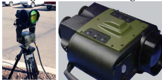
Agent-Portable Surveillance System (left) and Thermal Imaging Device (right).

Importantly, while several delays have occurred in implementing the Arizona Technology Plan, DHS has realized some taxpayer savings. CBP initially estimated that the total life-cycle costs of the new plan would be about $1.5 billion for Arizona. 177 However, the Department saved 75 percent on its IFT contract. 178 These savings have allowed DHS to procure other resources, such as tactical aerostats, which, for the most part, have been located in the RGV sector. 179 Aerostats have high-definition cameras with 10 miles of visibility, depending on the wind. However, smuggling is so pervasive that it is difficult for agents to address everything aerostats detect. 180 Despite detection success, aerostats also experience weather and maintenance