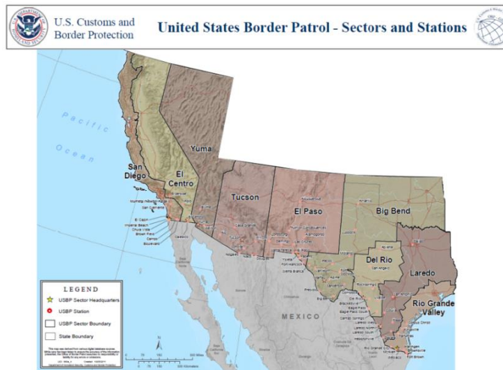
Figure 1: Nine Sectors of the U.S.-Mexico Border

Each of the nine sectors of the U.S.-Mexico border has unique terrain and faces endemic challenges. 81 For example, the RGV sector border is in the middle of the Rio Grande, a narrow, often shallow, and easily navigable river. Smugglers cross the Rio Grande by foot, raft, or, in some locations, vehicles. 82 This makes enforcement and security quite daunting. In Arizona, two mountain ranges provide concealment for smugglers and illegal crossers. Additionally, protected lands, including national forests, wildlife refuges, military training ranges, and a Native American Reservation, restrict access to approximately 80 percent of the border in the Tucson and Yuma sectors. 83