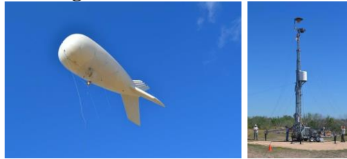
Figure 8: Tactical Aerostat

challenges and are only operational 60 percent of the time. 181 It is estimated that each Aerostat currently costs $5 million, per year, to operate and maintain. 182