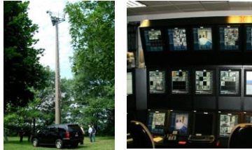
RVSS with images transmitted to Border Patrol station.

RVSS constitutes 30- to 90-foot towers with two pairs of cameras each—these cameras provide multiple color and infrared images. 156 RVSS differs from IFTs in that it lacks radars. 157 RVSS is remotely controlled by Border Patrol with images transmitted to their stations. 158 The purpose of this technology is to “monitor large areas of the international border or critical transit