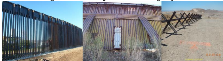
Figure 3: Examples of Fencing Styles

Bollard Fencing in Tucson Sector (left); Legacy Fencing in Tucson Sector (middle); Vehicle Barrier Fence – Normandy in El Centro Sector (right).