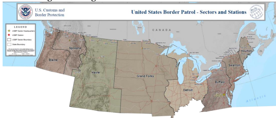
Figure 11: Eight Sectors of the U.S.-Canada Border