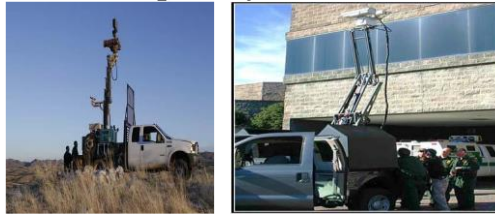
MSC (left) and MVSS (right).

MSC consists of a truck carrying a mounted camera and radar. 163 MVSS, also known as a “Scope Truck,” is similar, but consists only of a camera, and no radar. 164 Secretary Johnson recently emphasized that MSC is a priority for his agency. 165 The current MSC fleet consists of 49 systems in Arizona with plans to locate more in Texas. 166 While the Arizona Technology Plan originally called for MVSS, these systems have also been relocated to RGV to address the change in threat to that sector. 167 MVSS is also located in other sectors along the border, including the San Diego sector. 168