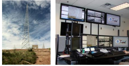
IFT with images transmitted to a Border Patrol station.

IFTs contain surveillance equipment, such as “ground surveillance radars and surveillance cameras mounted on fixed [ ] towers.” 150 Originally, the Arizona Technology Plan called for six IFTs, but Border Patrol currently is funded for three. 151 One IFT has been located in Nogales, Arizona. 152 Border Patrol has determined that locating a tower in the Tohono O’odham Nation—stretching 74 miles across the U.S.-Mexico border—is their highest priority. 153 Therefore, DHS plans to delay funding for an additional tower for approximately 18 months while environmental and tribal negotiations are worked out. 154 DHS has indicated that it does not plan to deploy IFTs on the northern border because the geography is not suitable for radar use. 155